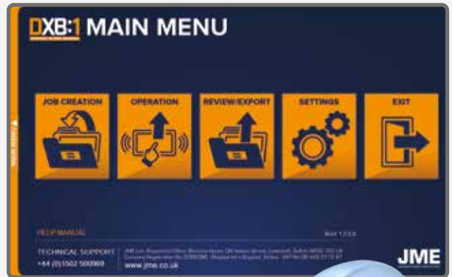
DXB CONTROL TABLET USER INTERFACE

The DXB Software Suite allows for real-time X-Ray image acquisition, along with viewing, image processing and archiving of images. The Pipeline Crawler and X-Ray source settings can be controlled directly from within the software without the need for other control devices. X-Ray images are stored in DICONDE data format and saved to the current project, along with any additional photographs, notes, inspection date, time and GPS co-ordinates. Using the JME stitching algorithm, a single image can be viewed in real-time, with the full weld stitched upon completion of the weld acquisition.