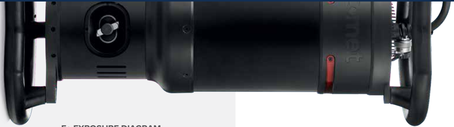
Fe EXPOSURE DIAGRAM 700 mm FFD / D7-type + Pb / D = 2,0