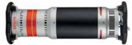
SMART EVO 200P / 300P