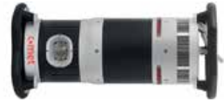
SMART EVO DIRECTIONAL