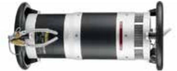
SMART EVO WATER-COOLED