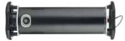
XPO EVO DIRECTIONAL